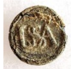
One of the enlisted uniform buttons found with the remains of a Continental soldier on the Camden battlefield.