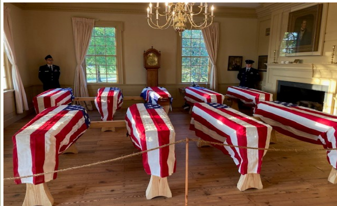
Coffins of 12 Continental Soldiers, including 5 teenagers, and 1 British Dragoon, lie in repose within Kershaw-Cornwallis House