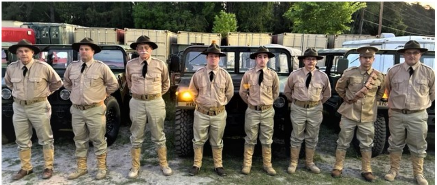
The MVCSC HMMWV Detail