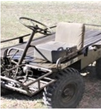
American Heritage Festival Photos February 2022