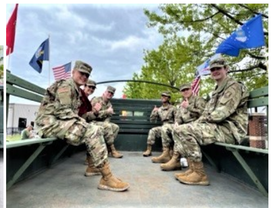
ROTC cadets enjoy Mike's Deuce