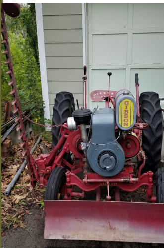
Paul's 1948 Gibson Model D

Paul's advice to young adults: "Pick a service, work with people and go to places you would not normally go, and in that process of serving grow the h___ up!"